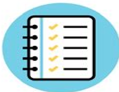
MAKE A LIST