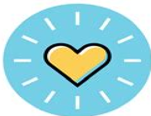
BE KIND TO YOURSELF