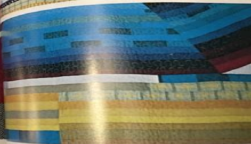
Plate 16b (below) Detail, Dialogue