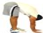
HAMSTRINGS & LOW BACK

⚠️ Consult a physician before starting any stretching regime. This chart is for informational purposes only.