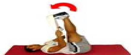
CALVES, HAMSTRINGS & LOW BACK