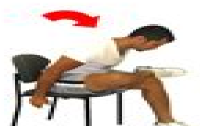
GLUTEAL & ABDUCTORS