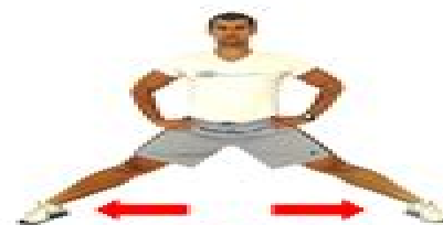
GROIN & ADDUCTORS