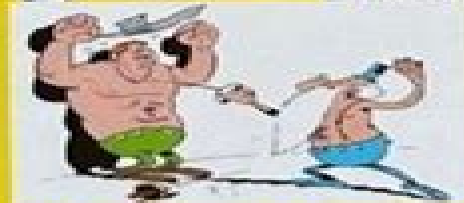
Les Collines Noires