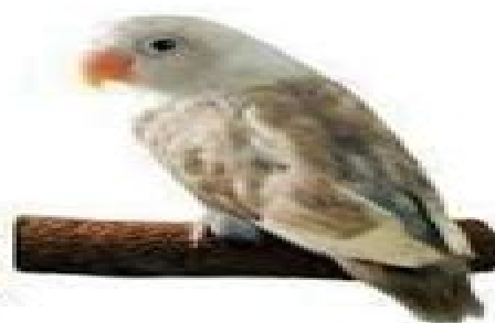
Fischer Slaty Pastel Mauve