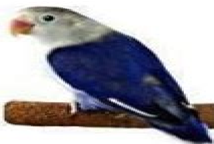
Fischer Dominant Pied D Violet