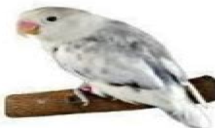
Fischer Dominant Heavy Pied Mauve