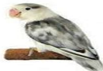
Fischer Dominant Pied Mauve