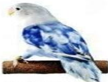
Fischer Dominant Pied Violet