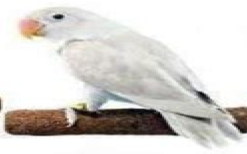
Fischer Slaty Ivory