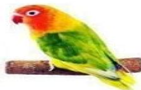
Fischer Dominant Pied Green