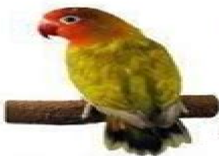
Fischer Edged Dilute Olive