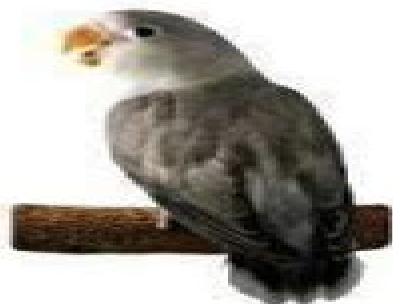
Fischer Dominant Pied Slaty Mauve