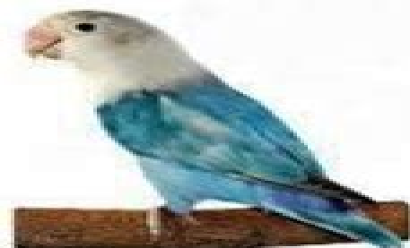
Fischer Dominant Pied Blue