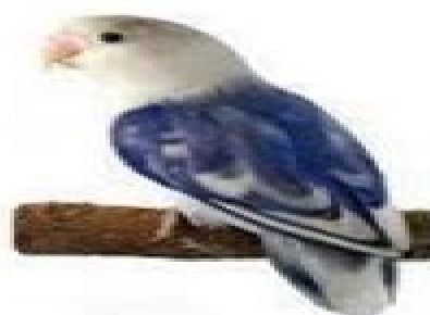
Fischer Dominant Pied D Violet