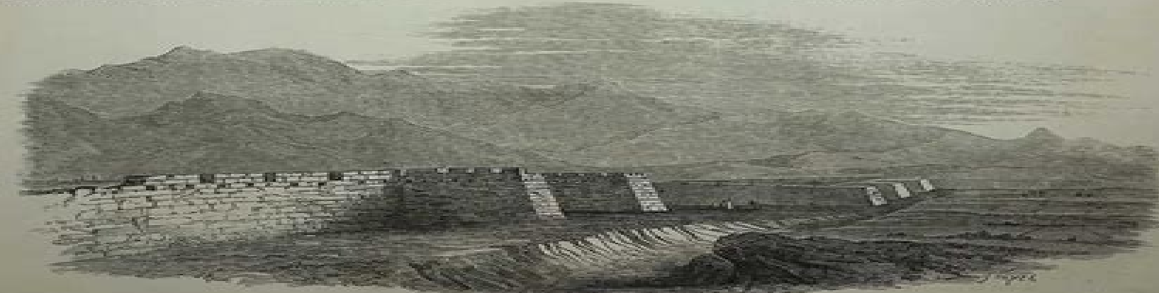
THE GREAT WALL, WITH THE TOWERS OF THE WALL.

There is a large number of towers placed in succession at short intervals, and were seen to the East, and West, the whole being almost perfectly level. The surrounding country was very fertile, and the soil was rich. The wall was built of brick, and the stones were of the same material. The wall was built by the Chinese, and the stones were of the same material.