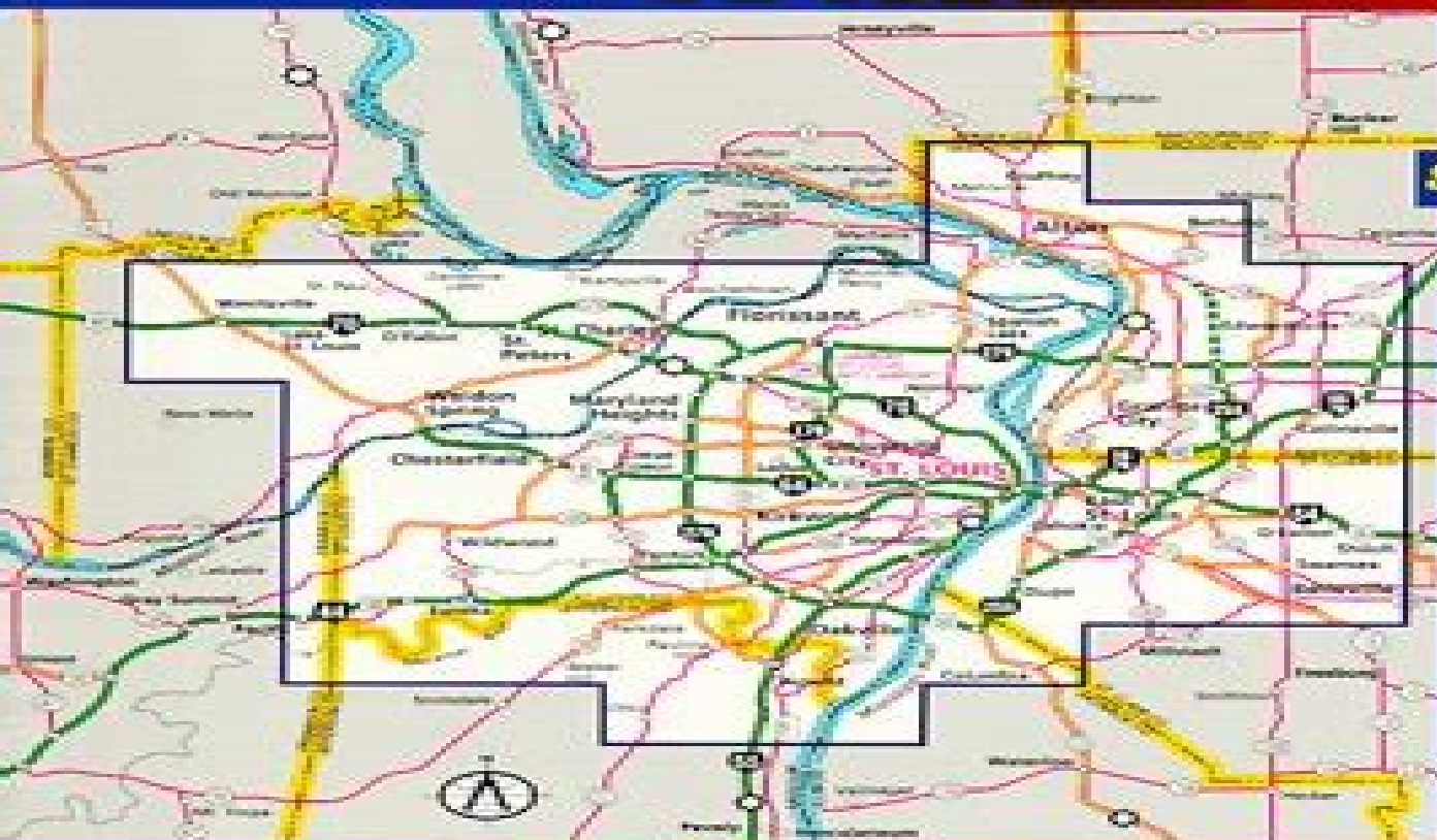
StreetFinder Coverage Area