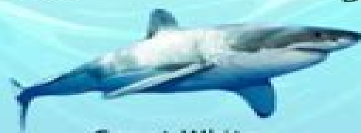
Great White Shark