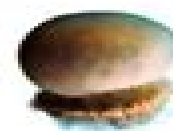
Lion's Mane Jellyfish