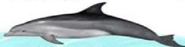
Common Bottlenose Dolphin