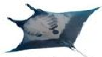
Giant Manta Ray