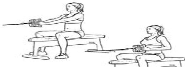
Seated / Low Cable Row 3 sets / 10 reps