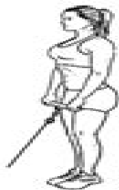
Cable Upright Row 3 sets / 10 reps