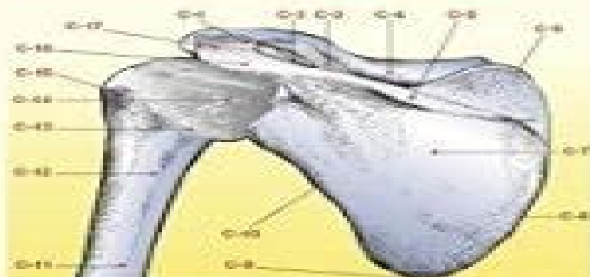
SHOULDER – POSTERIOR