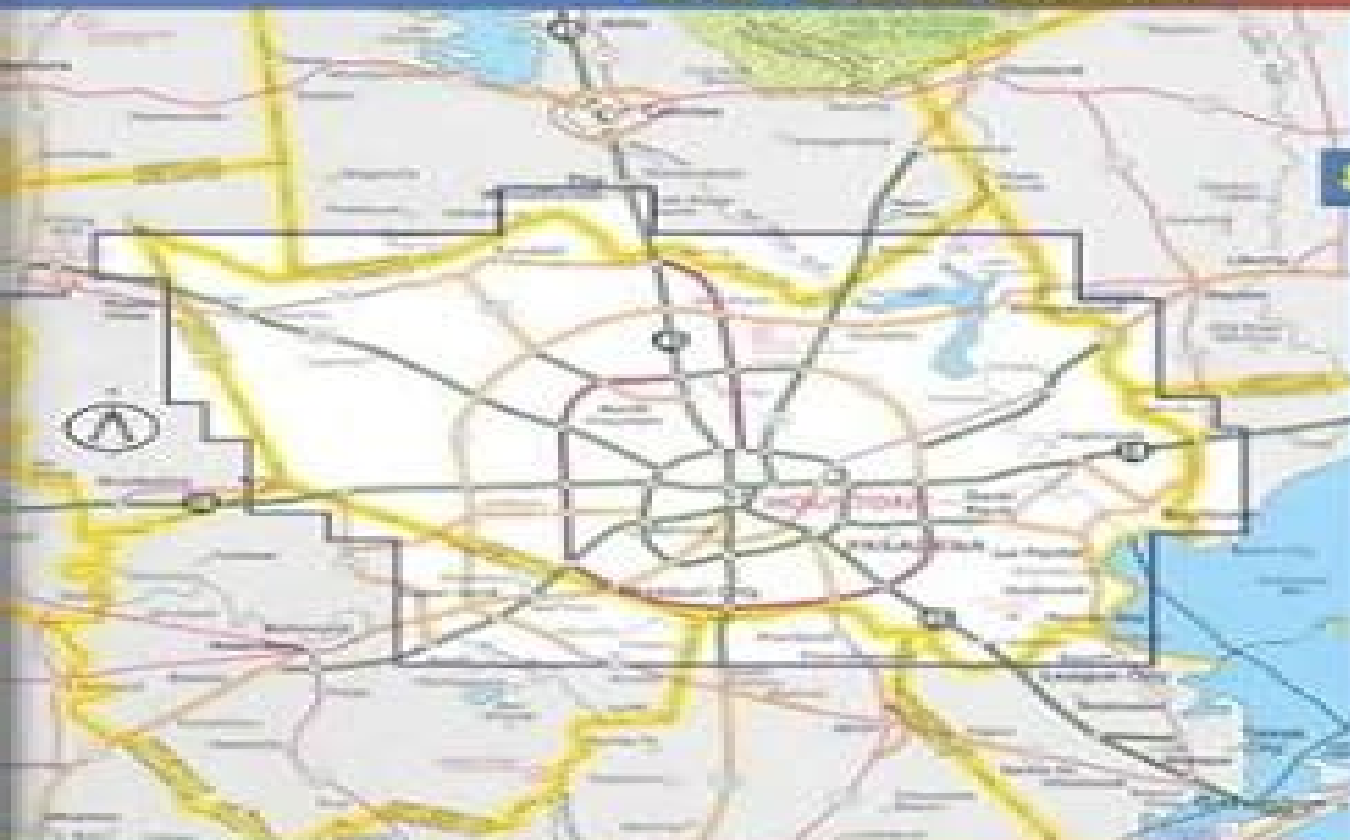
StreetFinder Coverage Area