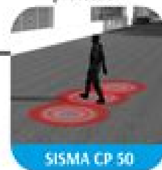
Protection of raised floors