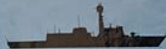
STANPLEX 2000 CLASS