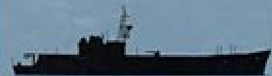
PRINCIPE DE ASTURIAS CLASS