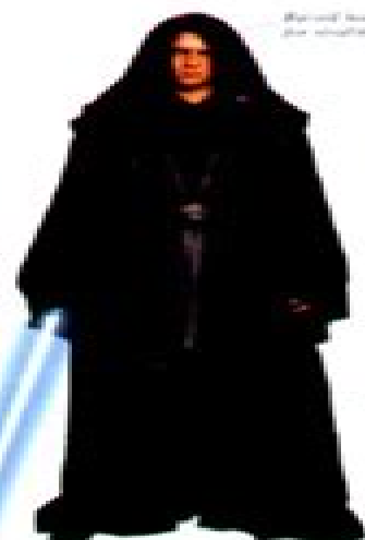
Revealed: Anakin's true identity.