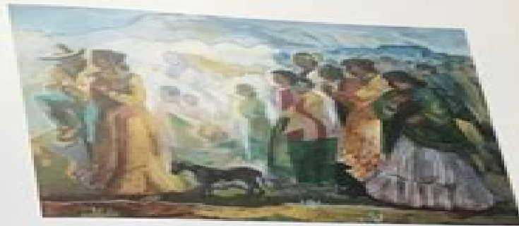
15. Lloyd Meylan, Indian Communal , watercolor, 19 x 24-1/2 in.