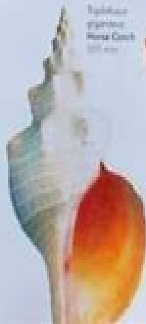
Stomatopoda stomatopoda Horse Conch 100 mm