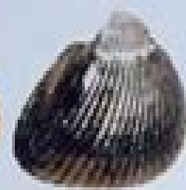
Argopecten argus Pensacola Ark 45 mm