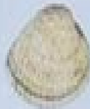
Chamaelea Chamaelea 25 mm