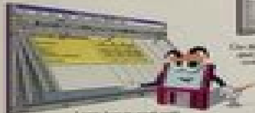
Learning Lotus 1-2-3 R5 with interactive worksheets. See pages 1-10