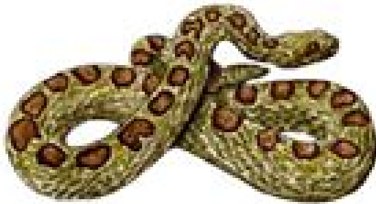
Snakes and Lizards