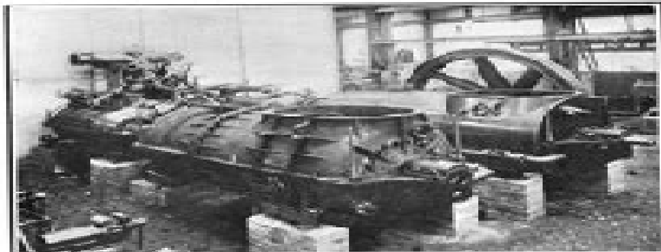
© 2006 The Authors Journal compilation © 2006 Blackwell Publishing Ltd