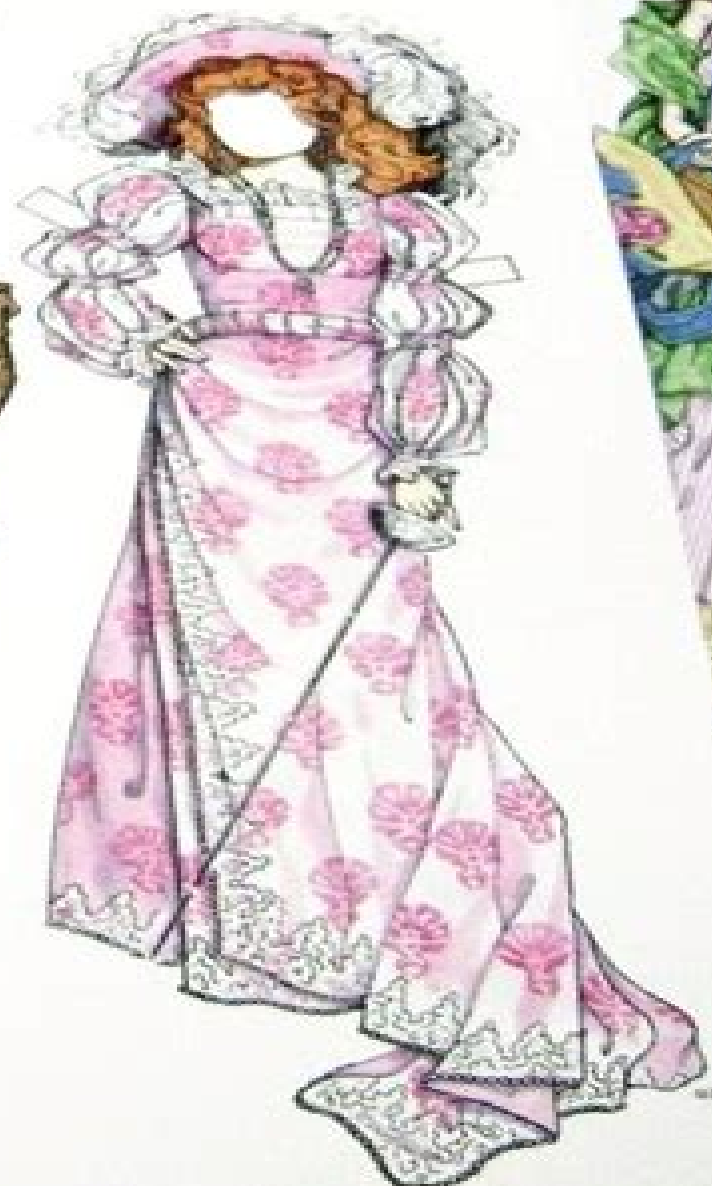
La Dame de Chaland