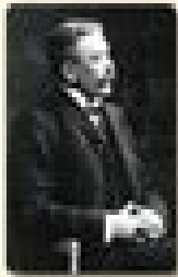
Ferdinand de Saussure (1857 - 1913)

Swiss linguist whose ideas laid a foundation for many significant aspects in the 20th century. He was considered one of the fathers of 20th century linguistics. Now many modern linguists consider his ideas to be outdated.