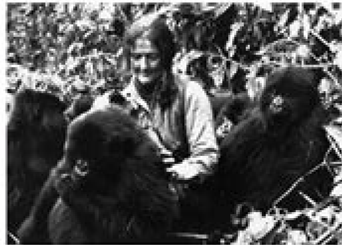
Dian Fossey - primatologist