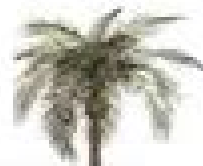
CYCADS and CONIFERS