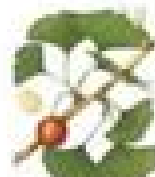
GINKGOS and GNETOPHYTES