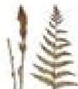
FERNS and CLUB MOSSES