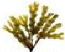
BROWN and RED ALGAE