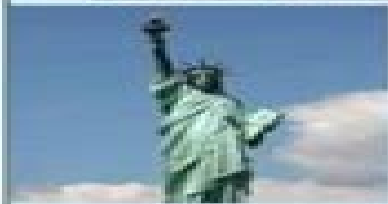
Statue of Liberty New York