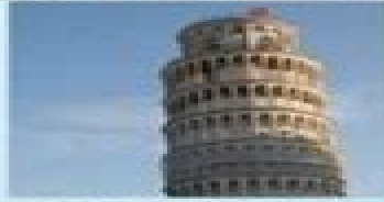
Leaning Tower of Pisa Italy