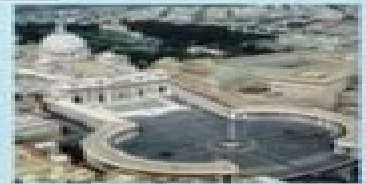
St. Peter's Basilica, Vatican City