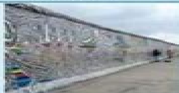
Berlin Wall Germany