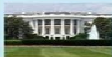
The White House Washington, D.C.