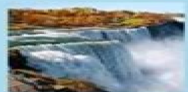
Niagara Falls Canada & New York