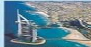
Burj Al Arab Hotel United Arab Emirates