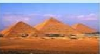
Pyramids of Giza Egypt