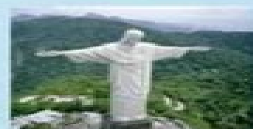
Christ the Redeemer Rio De Janeiro, Brazil