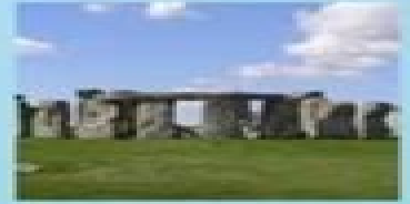
Stonehenge United Kingdom