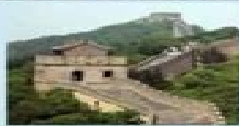
Great Wall of China, China