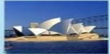
Sydney Opera House Australia