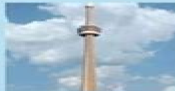
CN Tower Toronto, Canada