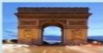
Arc de Triomphe Paris, France