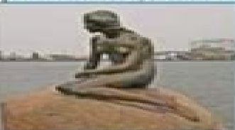
Little Mermaid Denmark