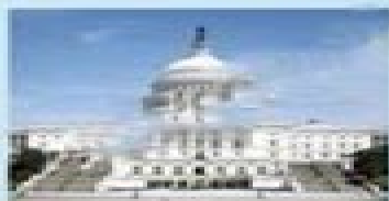
Capitol Hill Washington, D.C.