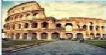
Colosseum Rome, Italy