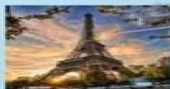
Eiffel Tower Paris, France