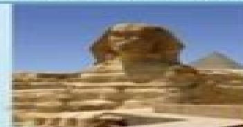
The Great Sphinx Egypt