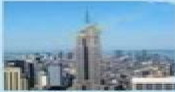
Empire State Building, New York City