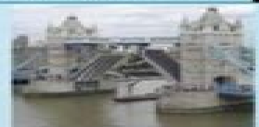
Tower Bridge London, England