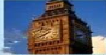
Big Ben London, England