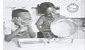
The Cake Bake