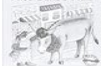
Miss Duke's Mule