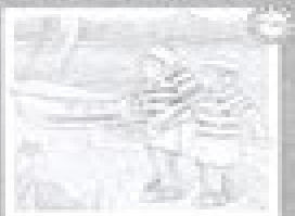
A Race on the Lake