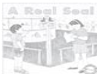
A Real Seal