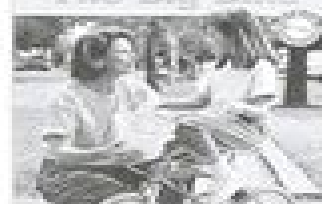
The Big Bike