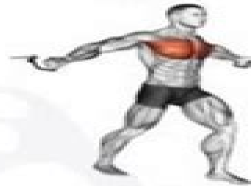
CABLE PEC FLYS