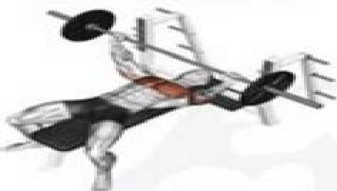
FLAT BENCH PRESS