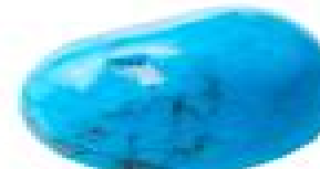
turquoise (blue howlite)