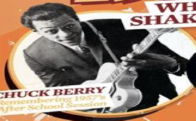
CHUCK BERRY Remembering 1957's After School Session

PAYOLA 1959 The scandal that rocked the music world