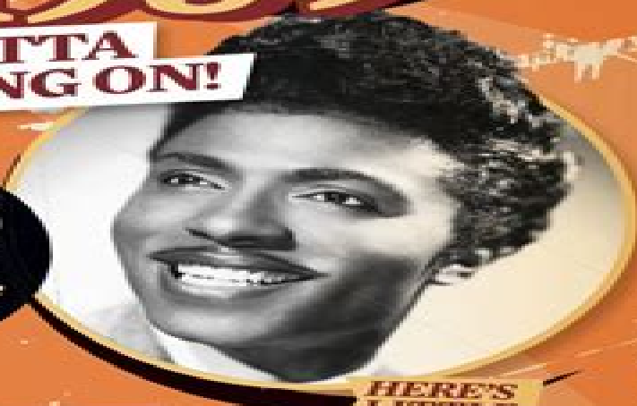
HERE'S LITTLE RICHARD Behind the scenes of a rock'n'roll classic

PAYOLA 1959 The scandal that rocked the music world