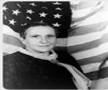
• Gertrude Stein