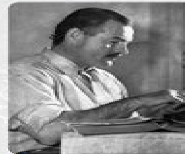
• Ernest Hemingway