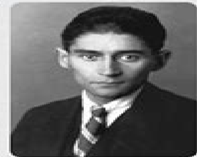
• Franz Kafka