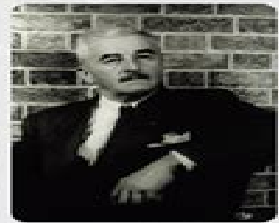
• William Faulkner