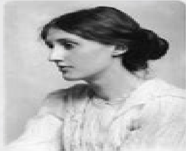
• Virginia Woolf