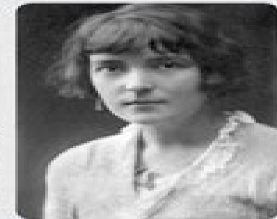
• Katherine Mansfield