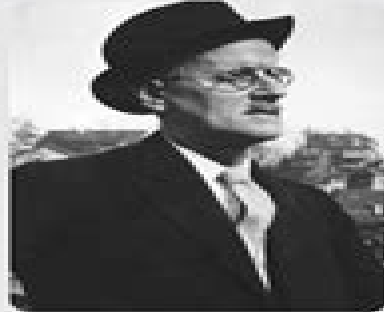
• James Joyce