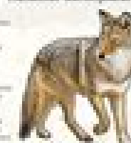
COYOTE Canis latrans