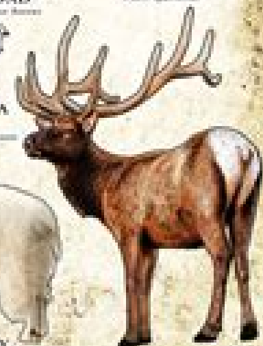
AMERICAN ELK Cervus canadensis

Rocky Mountain National Park is a treasure trove of wildlife. The park's diverse habitats, from alpine tundra to riparian forests, support a wide variety of plant and animal life. Many of the species found here are rare or endangered, making the park a critical refuge for them. Visitors can enjoy watching wildlife in their natural habitats, and the park's ranger-led programs provide valuable information about the park's ecology and the animals that call it home.