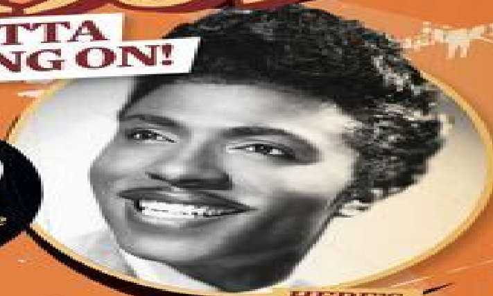
HERE'S LITTLE RICHARD Behind the scenes of a rock'n'roll classic

PLUS Carl Perkins ★ The Rock 'n Roll Trio ★ Billy Lee Riley ★ Cliff Richard ★ And more!