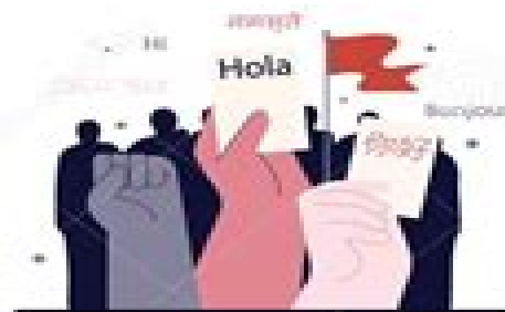
Diplomacy and pacifism