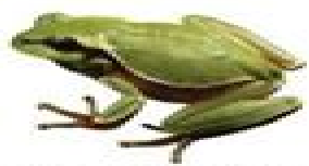
Pine Barrens Treefrog