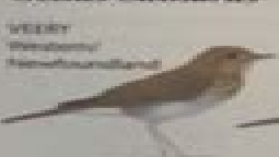
VEERY (Catharus) Newfoundland