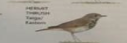
HERMIT THRUSH Tanager Eastern