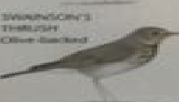
SWAINSON'S THRUSH Olive-backed