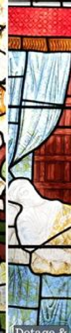
Dotage & Death