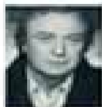
SIR IAN MCKELLEN

Shakespeare, Donne, Brooke, Pope, Wordsworth, Byron, Shelley, Keats, Yeats, Blake, Lear, Whitman, Tennyson, Dickinson & many others