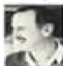
DAME GLENDA JACKSON