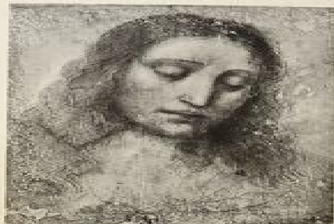
L. F. Dutton & Co.

It differs from sculpture and painting diametrically: language comes to us consciously like them. Speech, like music, is a string of sounds. Writing is a string of signs. It is easier to imagine sounds in a sequence, than the page of a book. Let us get this disentangled from what is accidental. It is our custom to write from left to right along lines. Writing and printed matter look natural because we are accustomed to them. Other alphabets strike us as instantly more difficult, until we grow accustomed to them. Then direct we all are we for even from the specimens of writing on the following page. If the page is held up to the light, and looked through, or so