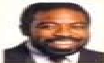
Les Brown Motivational Speaker, Author of 101 Thoughts to Drive You