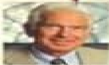
Dr. Warren Bennis Leadership Expert, Author of Ones & Geese