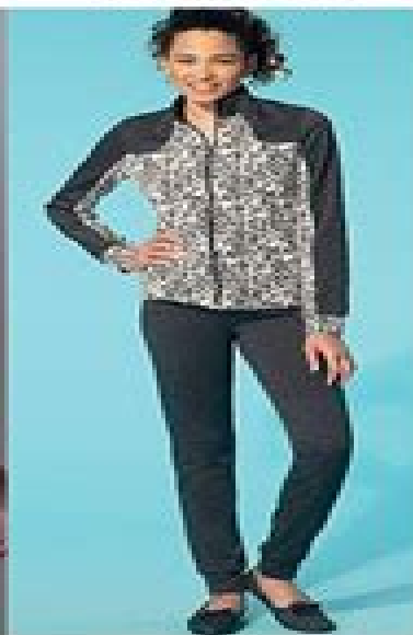
8. MCCALL'S M7293