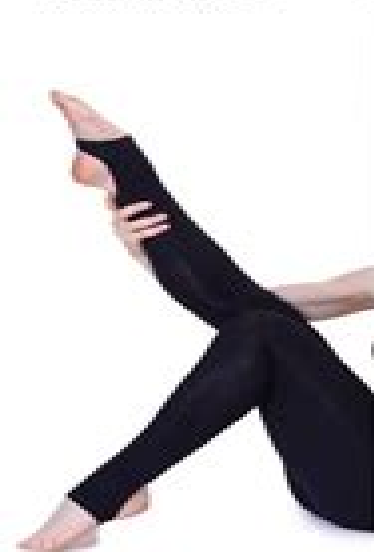
6. JALIE 2920