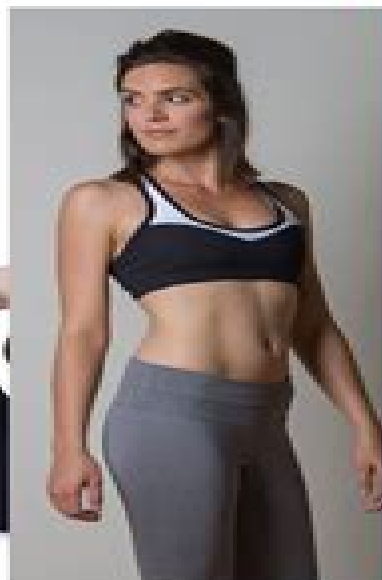
7. DUNBAR TOP BY SEWAHOLIC