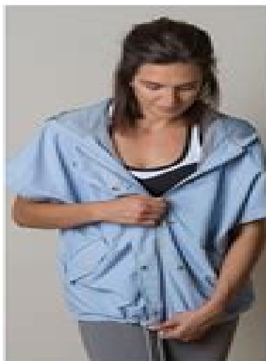
3. SEYMOUR JACKET BY SEWAHOLIC