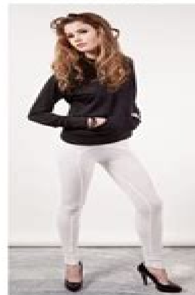
10. OOH LA LEGGINGS BY PAPER CUT