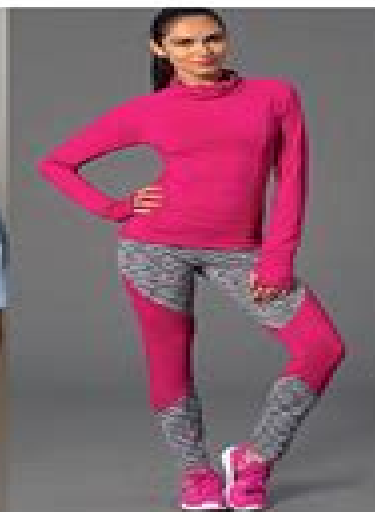
4. MCCALL'S M7261