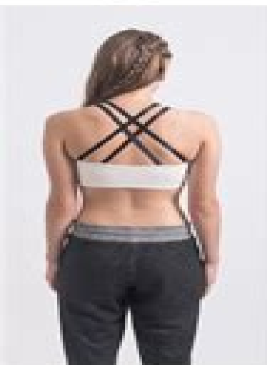
1. PNEUMA TANK BY PAPER CUT