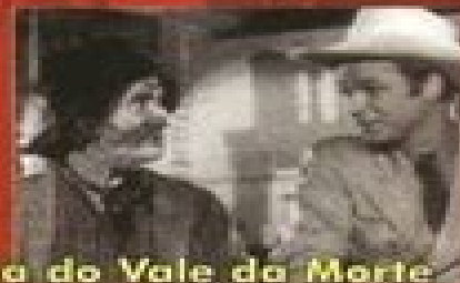
Legenda do Vale da Morte