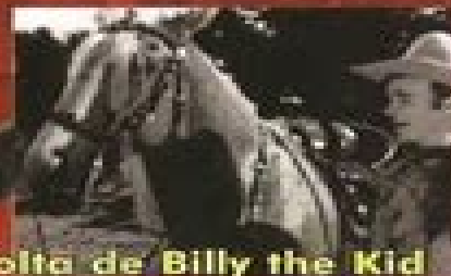
A Volta de Billy the Kid