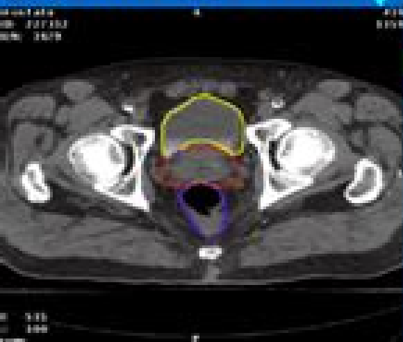
2: Tumour localisation