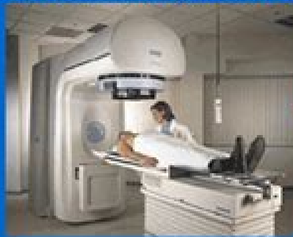
6: Radiotherapy treatment