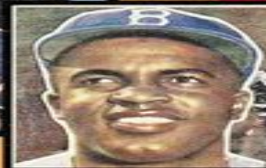
JACKIE ROBINSON third base BROOKLYN DODGERS