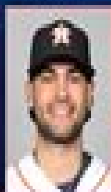
Lance McCullers Jr.