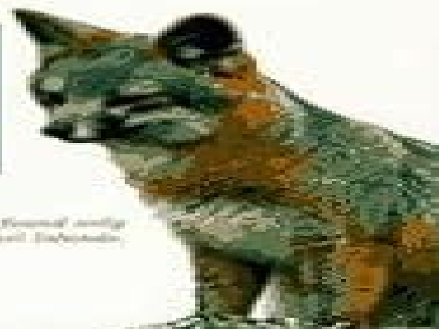
The bobcat is found only on the Channel Islands.