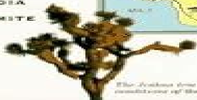
The Joshua tree grows in the arid mountains of the Mojave Desert.