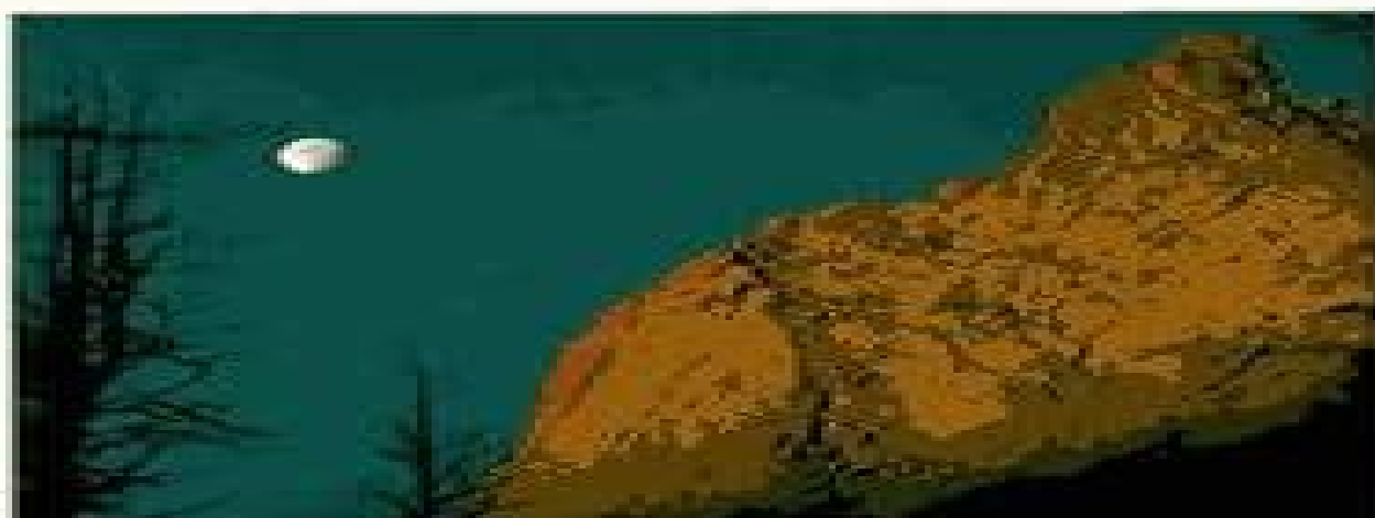
Sierra's Cathedral Peak near Mount Shasta