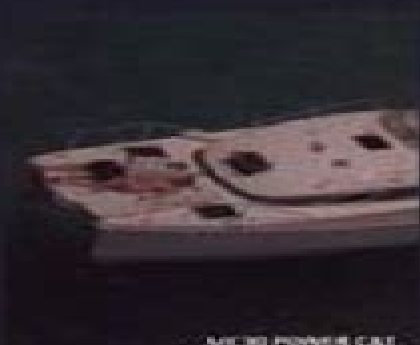
MICRO POWER CAT