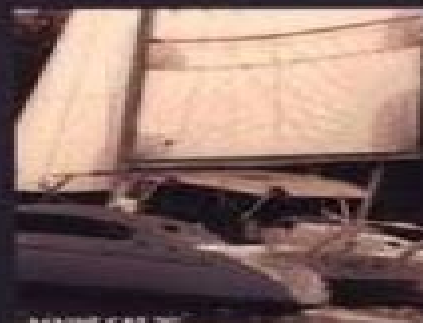
MAINE CAT 36