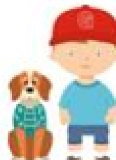
Polly Punctuation & Grammar Gabe