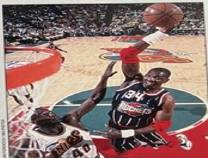
Did the Rockets' Hakeem Olajuwon average fewer or more points and rebounds a game last season than his career average? The answer's in the Register.