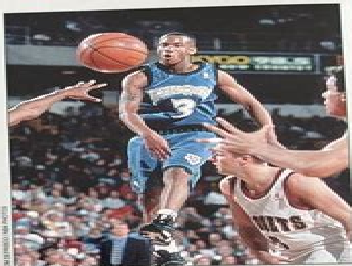
How many assists did Minnesota rookie Stephon Marbury have last year? It's in the Register.