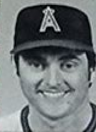
NOLAN RYAN, California Angels