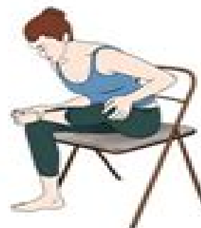
CHAIR PIGEON POSE