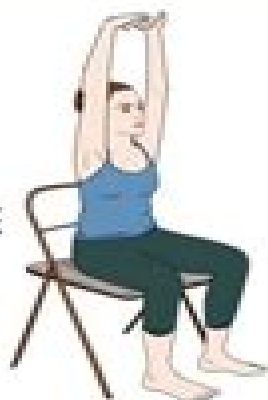
CHAIR RAISED HAND POSE