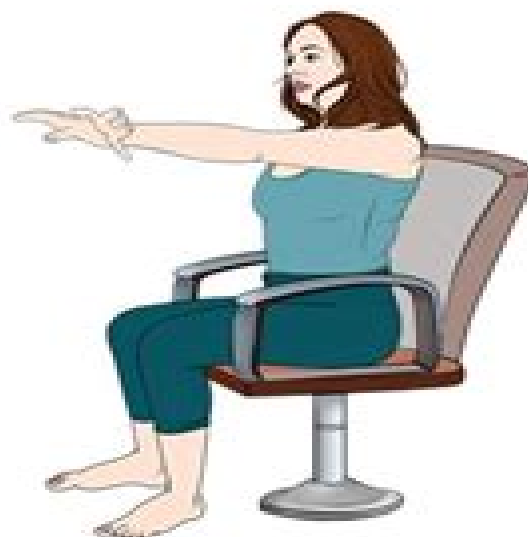
WRIST AND FINGER STRETCH