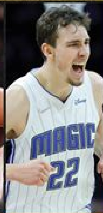
FRANZ WAGNER Orlando Magic